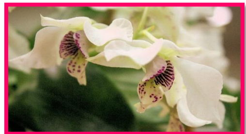
Dendrobium Royal Wings (Dendrobium Roy Tokunaga x Dendrobium Silver Wings) Diane Dickhut