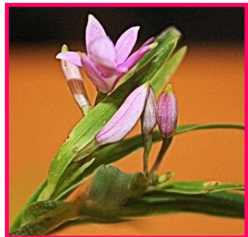
Epidendrum [Epi.] centropetalum Jorge Li